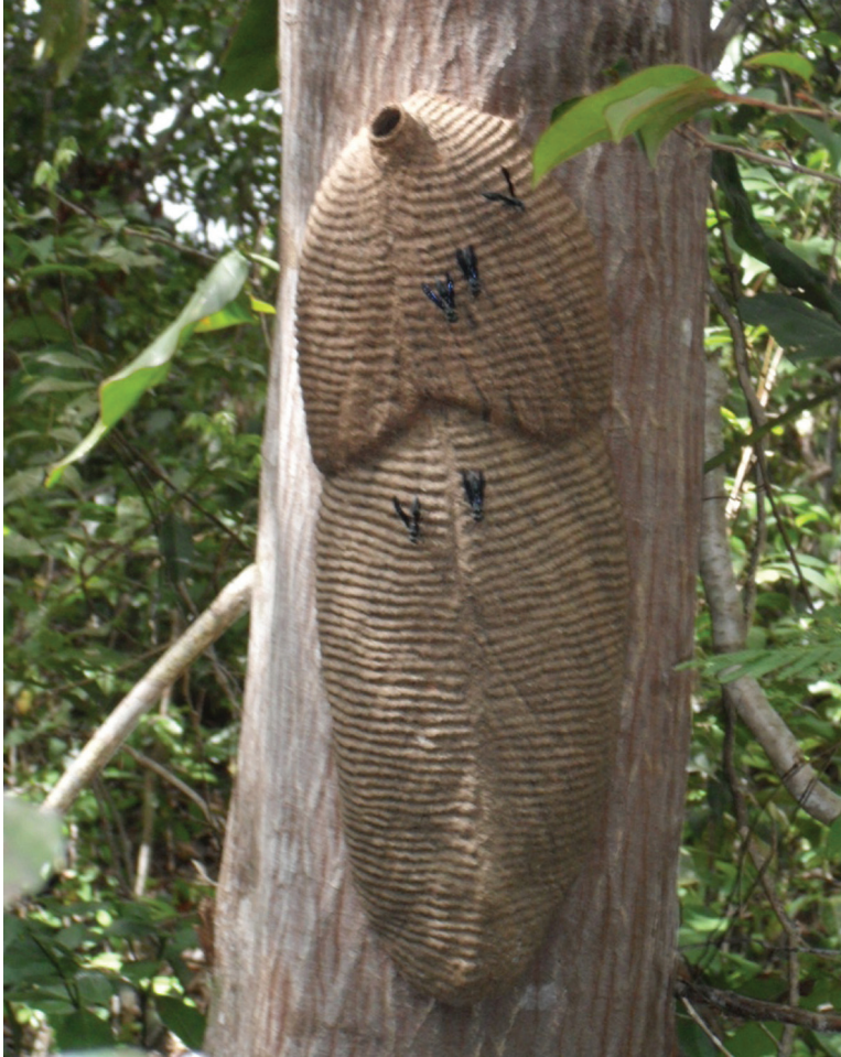
Figure 1. Nest of Synoecca septentrionalis collected in Santa Terezinha in the state of Bahia.